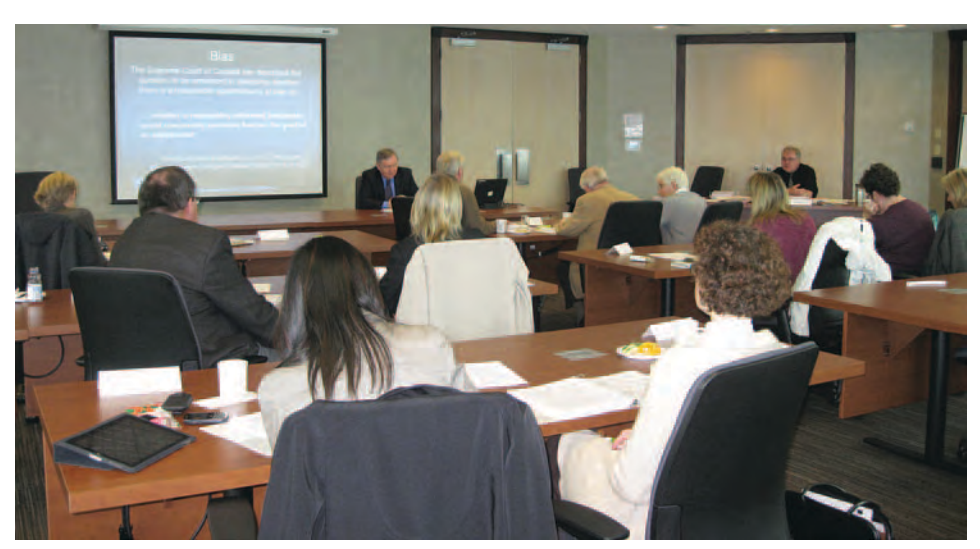
The Law Society held training sessions for members of both lawyer and public hearing panel pools. The sessions covered everything from hearing skills to practice and procedure.

"I guess, fundamentally, I believe in the importance of integrity of the profession and the importance of the profession being seen to have integrity. I don't know that